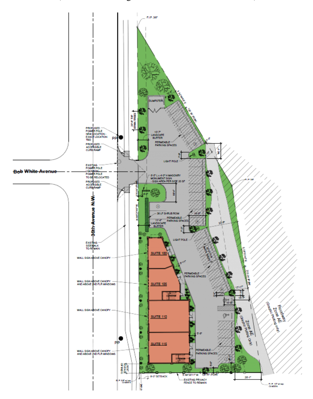
EXHIBIT A Proposed SPUD Site Development Plan (full sized drawings submitted herewith for record)