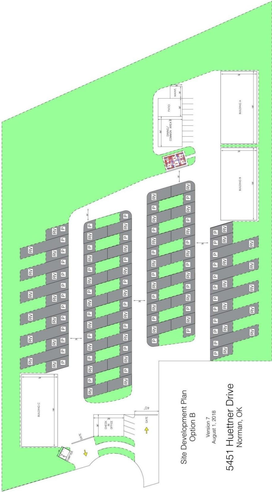
EXHIBIT B Site Development Plan – Option B