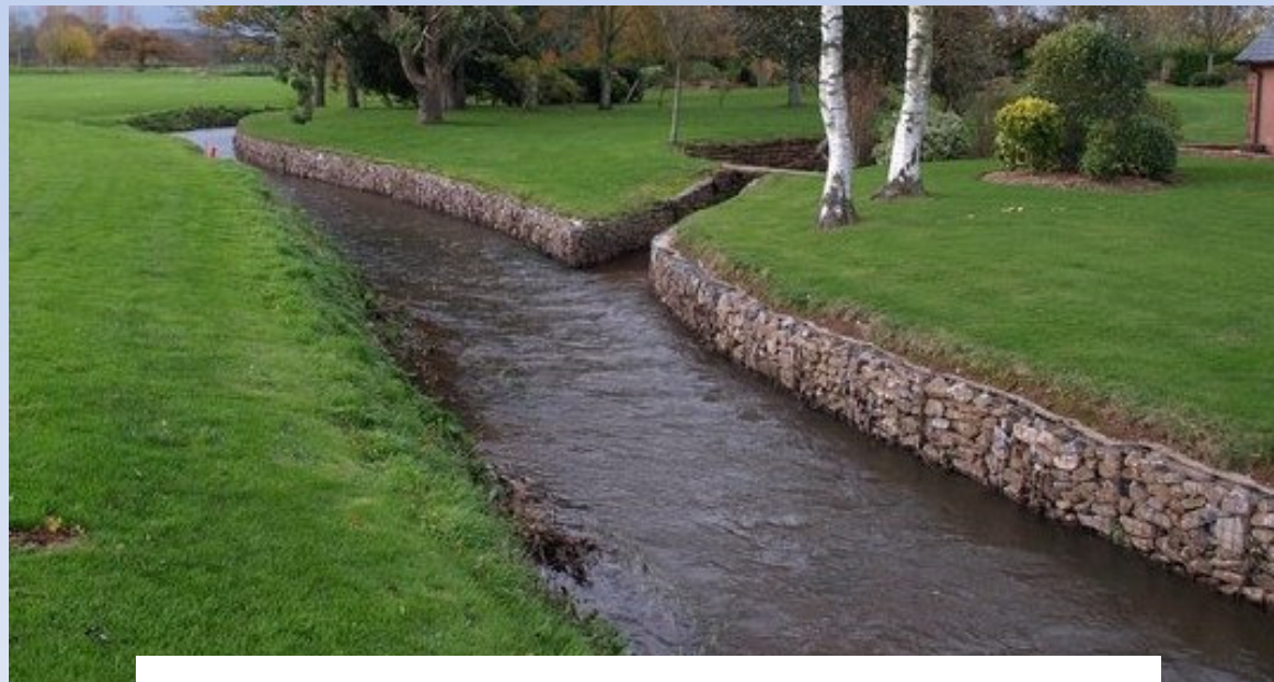
Example of an Improved Channel using Gabions