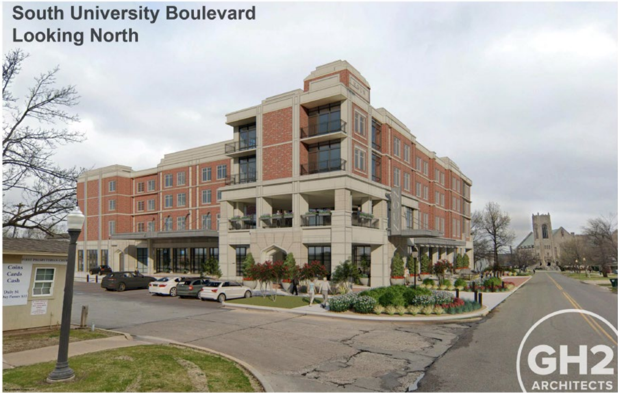
South University Boulevard Looking North