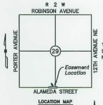
EXHIBIT 'A' TEMPORARY CONSTRUCTION EASEMENT SW/4 SECTION 29, T9N, R2W, I.M. CLEVELAND COUNTY, OKLAHOMA